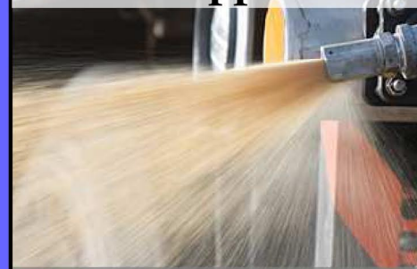
Enhanced Super Brine