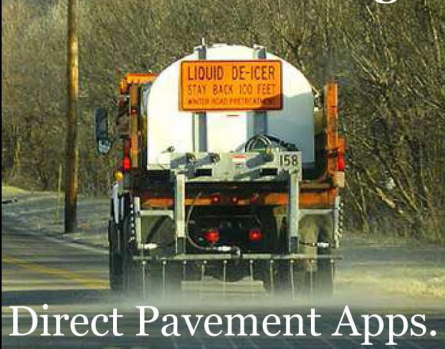
Direct Pavement Apps.